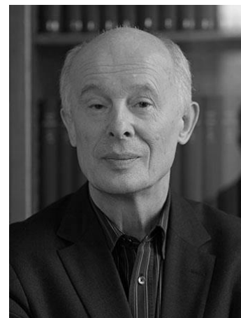
Prof. Dr. Dr. h.c. Hans Joachim Schellnhuber

Scientific Director at the Institute for Advanced Sustainability Studies Potsdam